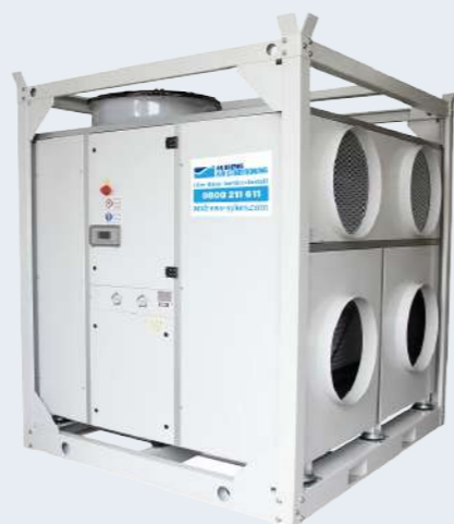
HPAC90 High Performance Air Conditioner

With performers and production staff relying on the space throughout a stretch of soaring temperatures, getting the temperature right wasn't optional. The brief came with its own set of challenges too: a sizeable area to cool, limited access for equipment, and an event schedule that left no room for delays. It called for careful planning and a team who could execute under pressure