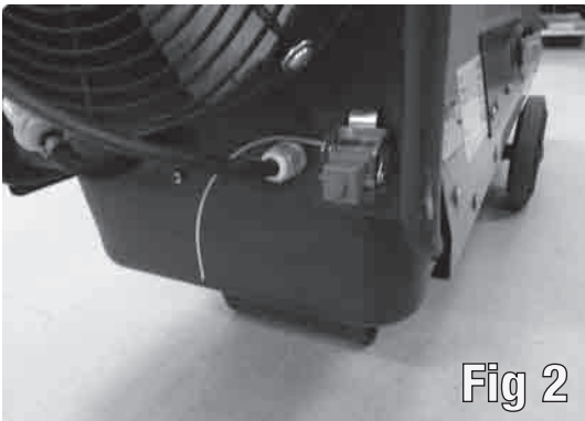
Fig 2 : Connect remote thermostat if required.