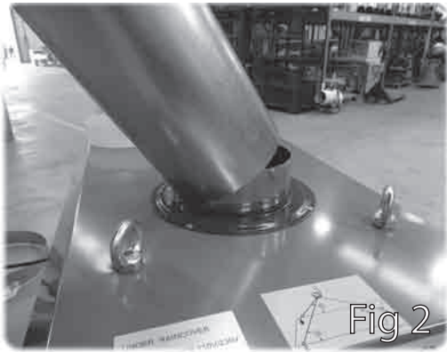
Fig 2 : Remove protective cover and fit 1mt exhaust flue.