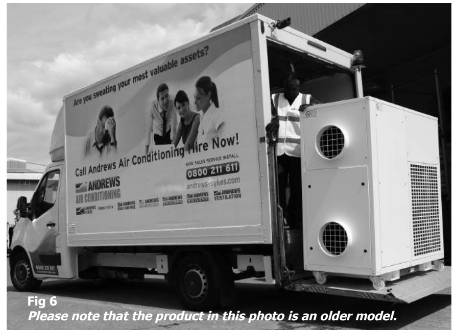
Fig 6 Please note that the product in this photo is an older model.