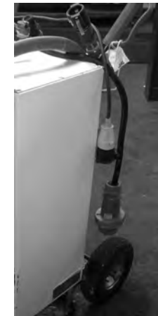
Fig 1 : Phase rotation does NOT need to be checked with this 415v appliance

Fig 1 5 pin 63amp 415 volt Appliance inlet plug found on the 36kW Boiler 240 volt 16amp axillary blue socket. These Sockets are used for secondary circulating pumps for underfloor heating applications