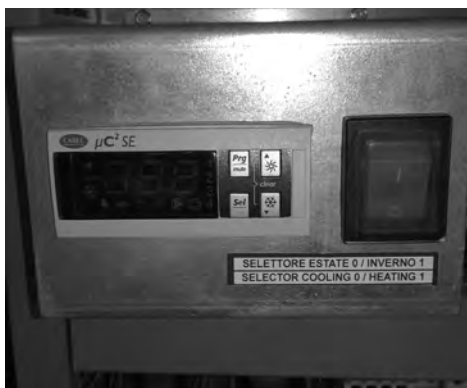
Fig 5: Carel 4 button controller Red switch position 0 Cooling selection Red switch position 1 Heating selection