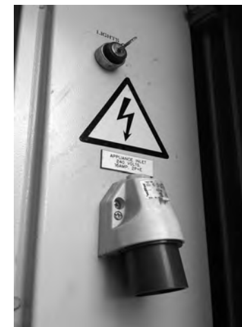
Fig 1 : 240 volt Appliance inlet plug

3 pin 16amp 240 volt Appliance inlet plug found on the 300kW Boiler