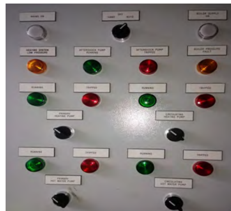
Fig 6: Example of the switch gear control panel