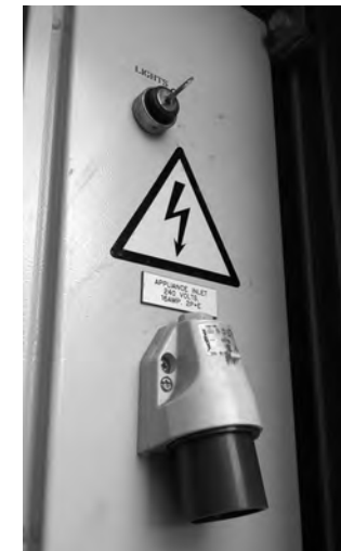
Fig 1 : 240 volt Appliance inlet plug

3 pin 16amp 240 volt Appliance inlet plug found on the 250kW Boiler