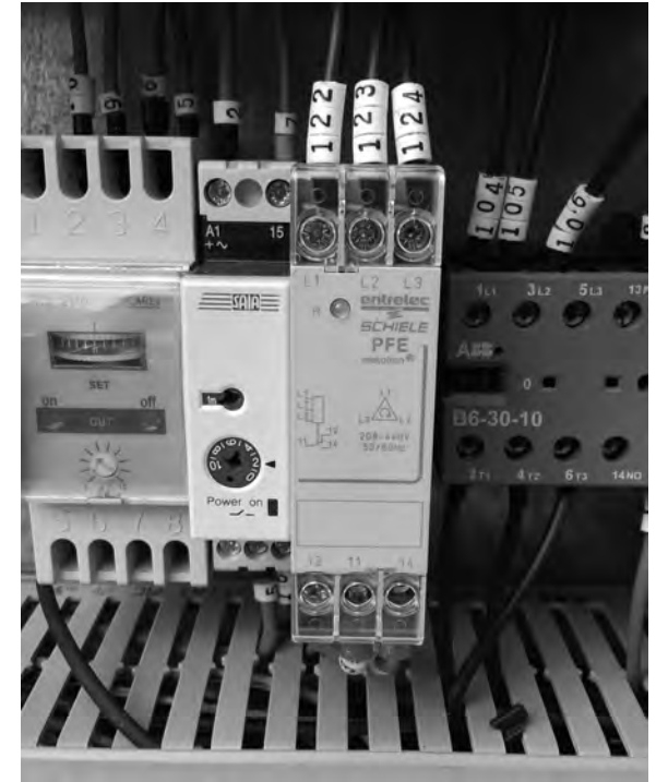
Fig 4 : When the electrical supply is connected and turned on then the phase rotation must be checked inside the electrical panel. Yellow light indicates correct phase rotation.