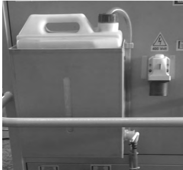
Fig 3: Header tank to be used to top up the chiller with water and continue to purge the system of Air