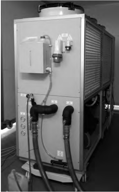
Fig 2 : Connect the flow and return pipework below 2" Bauer. Connect the water filling hose pipe to the bottom left filling point making sure the purge point bleed tape is open.